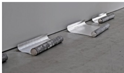
Untitled 1 Shuheï Fukuda Japanese paper, Japanese ink, slices of silver 183 x 122 cm, 2019 Haus der Kunst St. Josef (Solothurn/Switzerland)