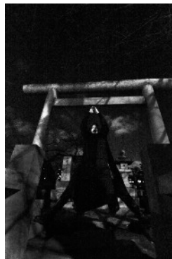
Beyond religion I , 2021, 391mm×273mm×62mm, Semi-Mat photo paper with Silver coated wooden frame