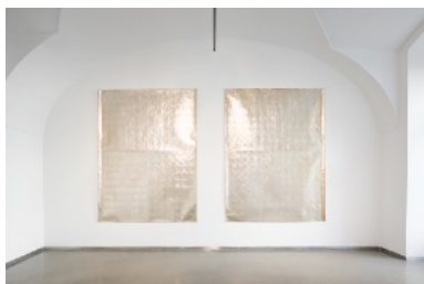
Untitled Shuheï Fukuda Japanese paper, Japanese ink, slices of silver

Instagram : https://www.instagram.com/shuheï.199431/