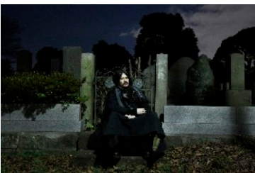
Beyond religion II , 2021, 755mm×522mm×62mm, Semi-Mat photo paper with Silver coated wooden frame

Instagram : https://www.instagram.com/hidem1224/